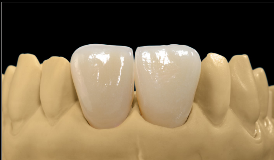
Fig. 34 A highly attractive representation showing outstanding aesthetic results.