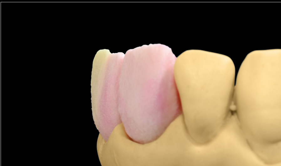
Fig. 36 ... a thin layer of Mask material is applied to the incisal area of the dentine to mask the oversized framework.