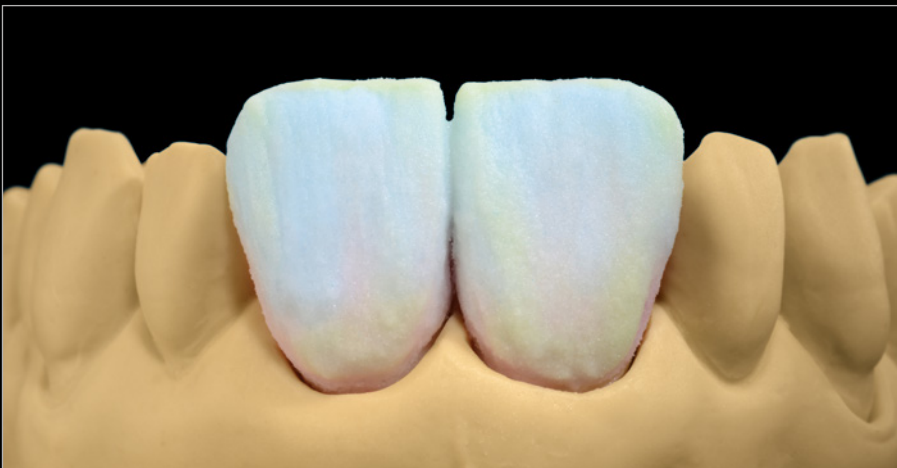
Fig. 32 ... the correct incisal ceramic for the shade is applied and feathered toward the dentine body. The restoration is then customised by completing the build up with Enhancers.