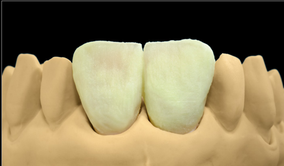
Fig. 33 The desired effect can thus be nuanced with correction layering or neutral shape corrections undertaken with enhancers.