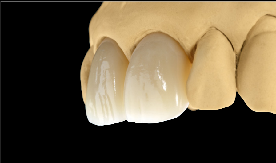
Fig. 26 Amazing personalised results can be achieved in just a few easy steps.

A complete list of the colour mapping of the HeraCeram Zirkonia 750 materials can be found in Section E.