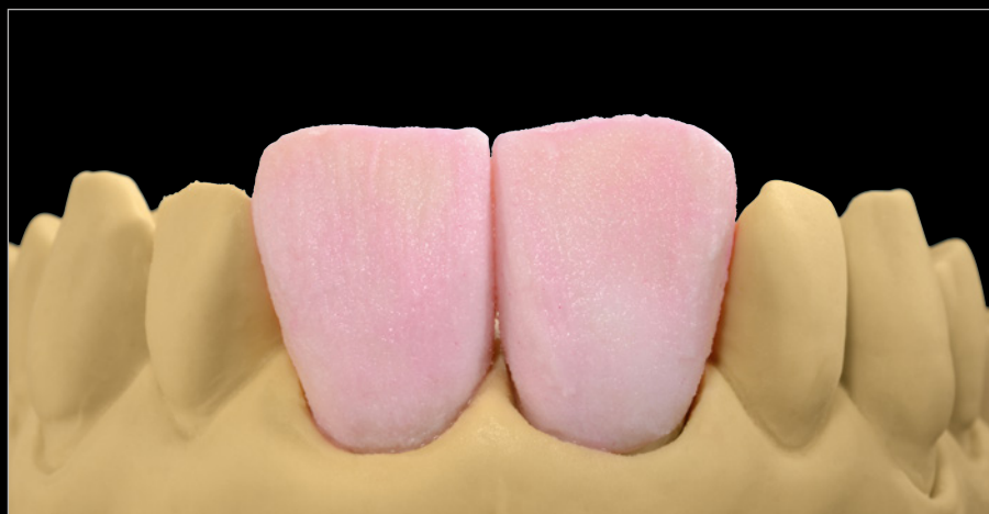
Fig. 29 Crown contours built up fully with dentine and/or Chroma dentine and cut back...