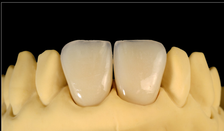
Fig. 39 With only minimal yet efficient effort, results can be achieved which are a pleasure to see.