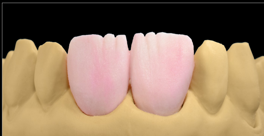
Fig. 30...and adapted to the desired contour.