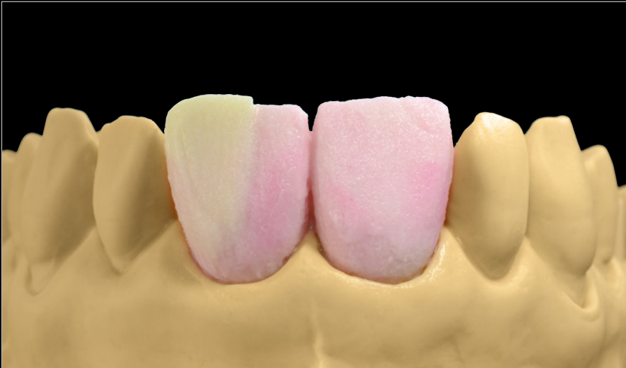
Fig. 35 The Mask components and a typical example of how they are applied: After the body has been built up and cut back ...

Incisal like ceramic with increased opacity, balances the transparency so that on the one hand, the in-depth effect is retained yet on the other hand the structure of the frameworks can no longer be perceived. MA bright and MA shadow can also be used to modify brightness.