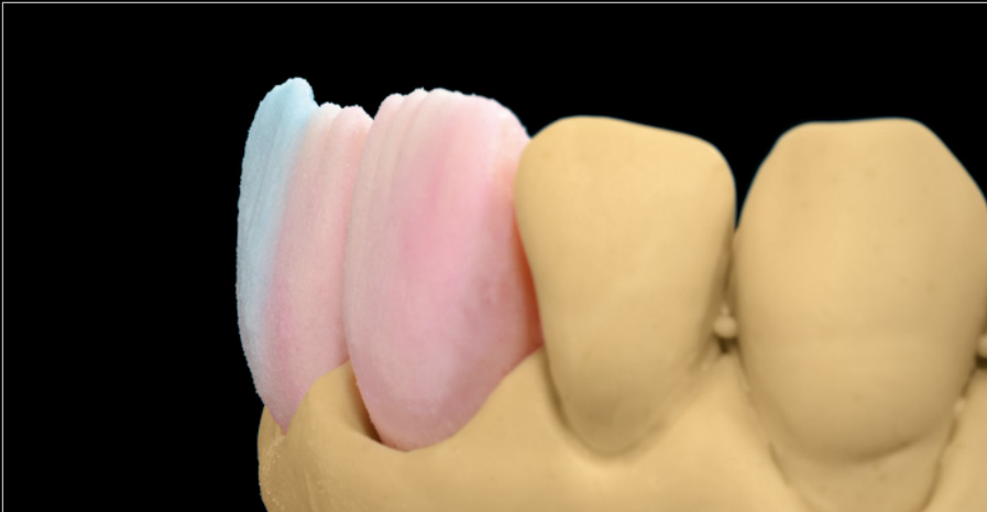
Fig. 31 The effect created by Enhancers: Once the dentine has been cut back, the mamelons are formed smoothly with a brush. After that...

incisors as well as canines to be reproduced easily. Even those deviations in shade which cannot be shown on a shade guide can be achieved in a controlled manner using the 6 Enhancers.