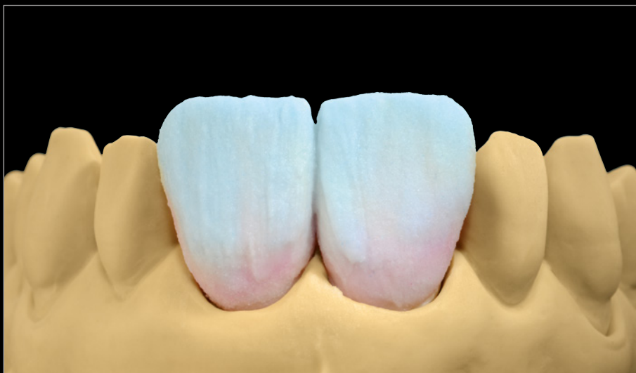
Fig. 38...built up again incisal and transparent materials.