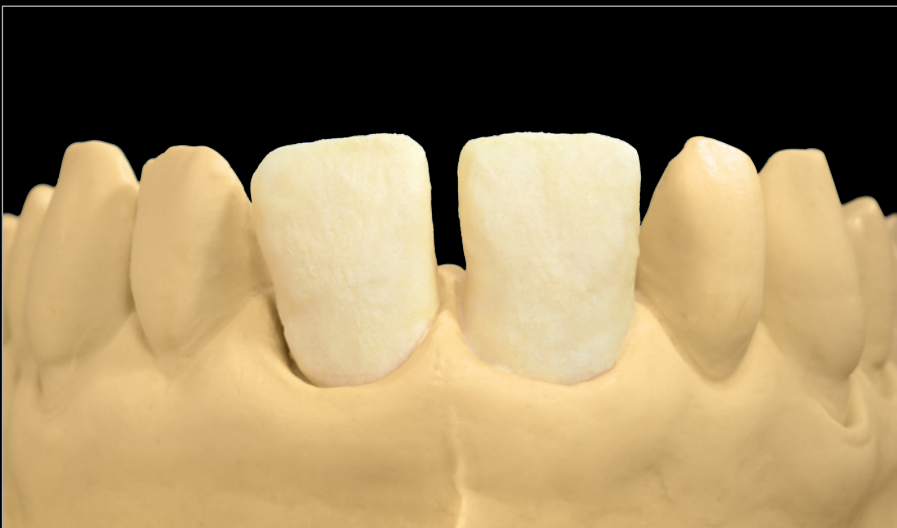
Fig. 27 (Teeth: 13–23): Increasers enhance the chroma and are placed in critical areas, if necessary without further layering, or wherever a frame or an area has to be masked properly even where only limited space is available.