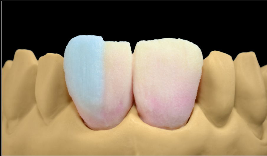
Fig. 37 Then as usual ...