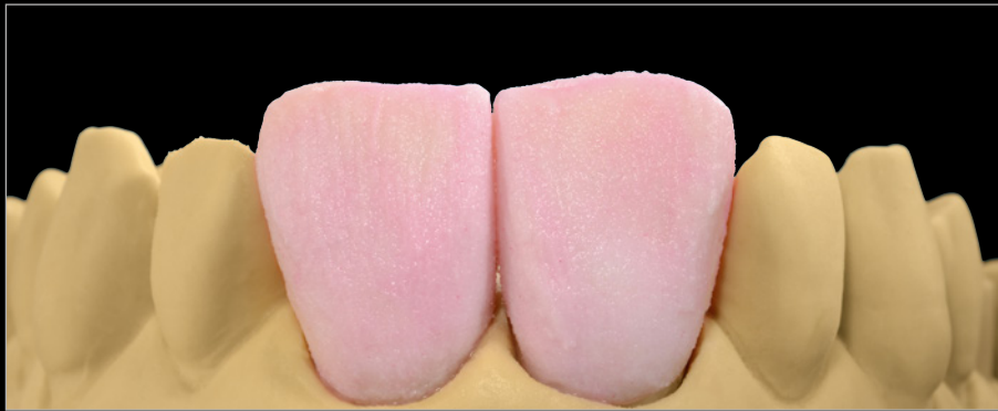
Fig. 42 The crowns are built up fully with dentine or chroma dentine to allow them to be cut back in a controlled manner.