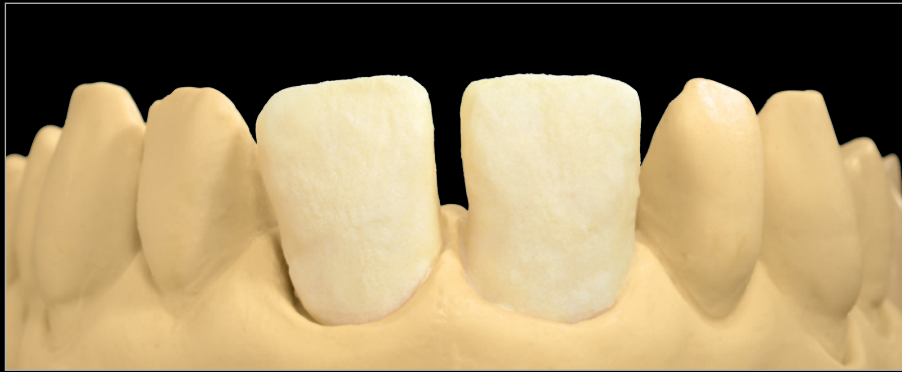
Fig. 41 Mixing the appropriate shade of dentine with mamelon or secondary dentine increases its chroma in the cervical region. These compounds intensify the colours' luminosity with their matching of chroma and fluorescence. (Alternatively, the colour-coordinated Increasers can also be used).