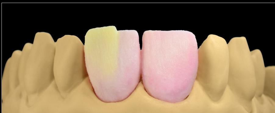
Fig. 44 To control the brightness or partial brightening of the dentine, the value materials in the incisal region are somewhat thicker (about 0.3 mm) and layered to the tooth with thin tapering.