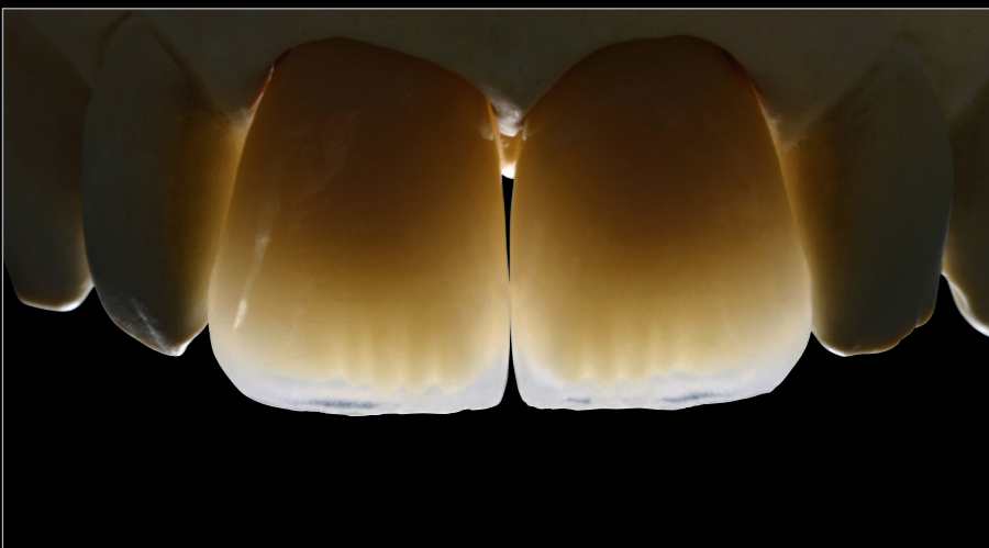
Fig. 52 In transmitted light.