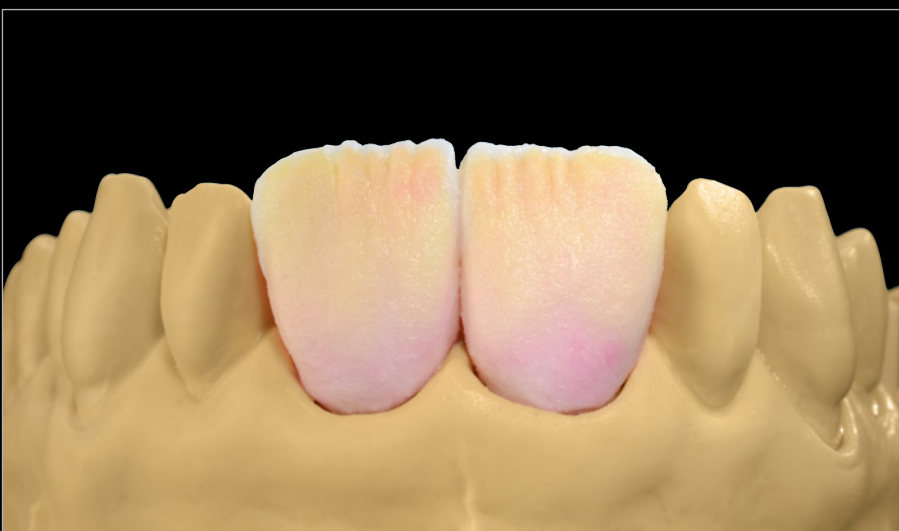
Fig. 47 A ridge of e.g. Opal transpa Ice is laid over the mamelons.