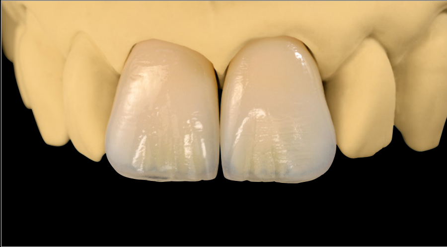
Fig. 51 Final stage ready for glaze and/or polish.