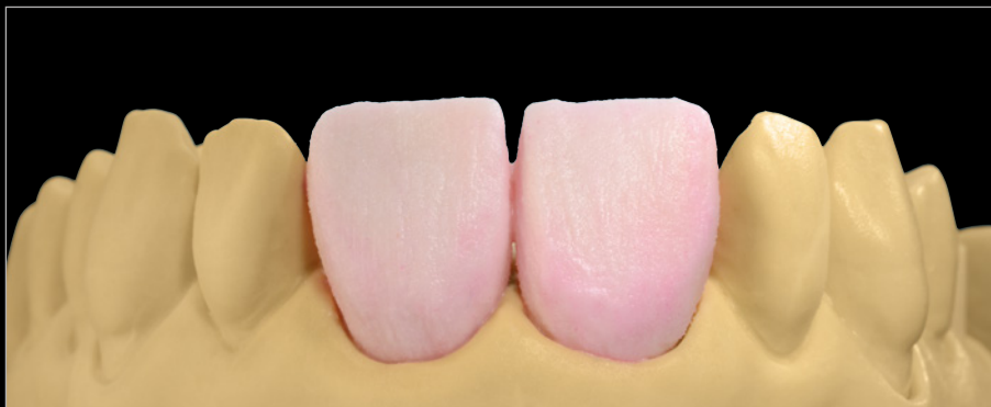
Fig. 43 The central incisor has been cut back.