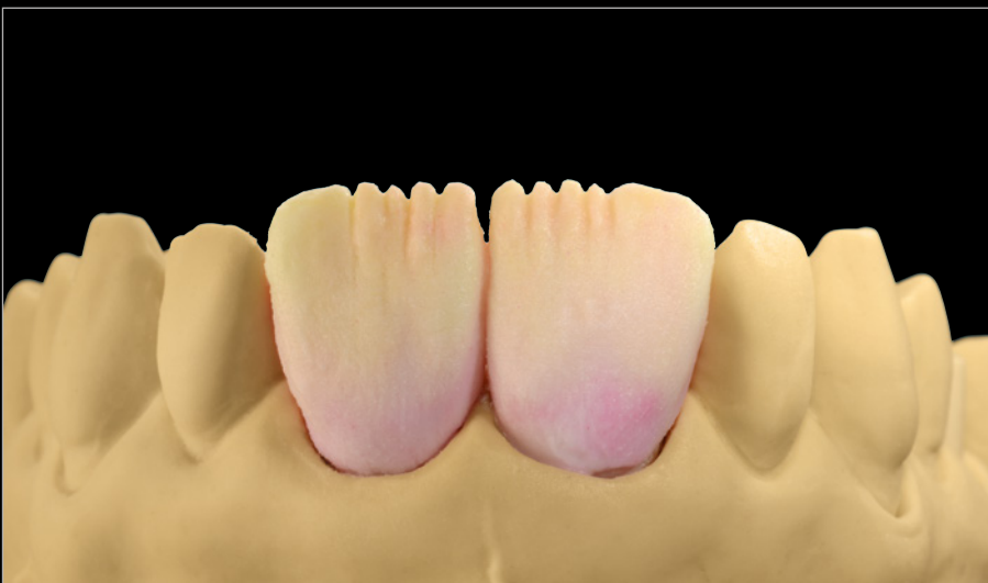
Fig. 46 ...and contoured like mamelons with a brush. This creates impressive interaction between the lighter and darker shaded areas. The resulting mamelon structures are further illuminated from within the layers by the highly fluorescent value materials.