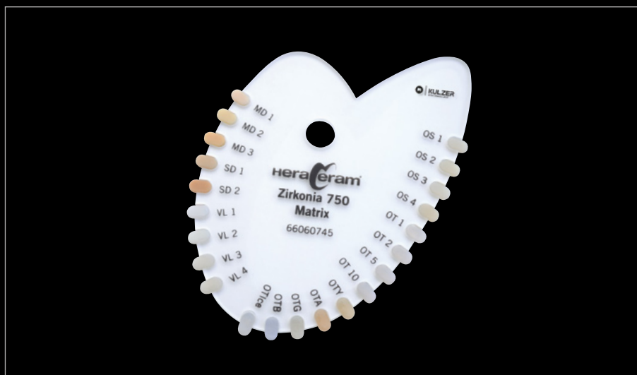
Fig. 40 Matrix shade guide.